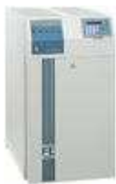
FERRUPS Tower UPS