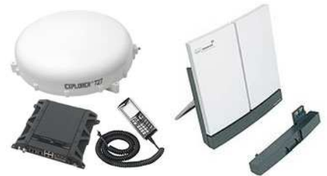
Explorer 727 / Explorer Link